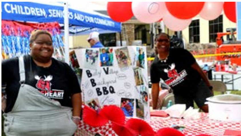
Mooseheart Child City took top honors in the People's Choice category.