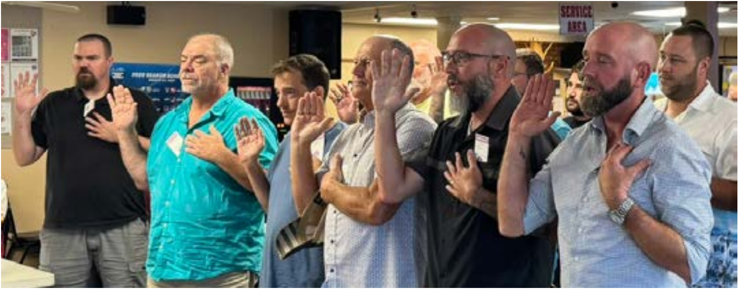
Candidates take oath during the Manatee 58 Moose Legion Conferral September 13, 2025.